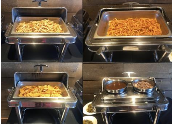
Plain, curl and waffle chips were served with pulled pork and gravy creating really tasty poutine

(parents and their co-parents) with children 18 months to 7 years old. Sponsored by CME and KBPA. 21 Physicians signed up for the event. Myla is also doing a follow up event in April with participants who have particular questions.