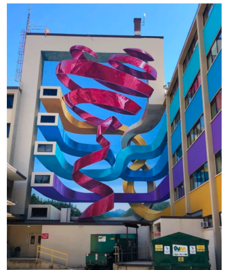
#KBRHGratitudeMural is now completed. 1st May - 28th May, 2021